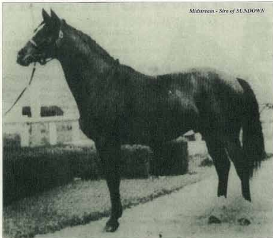
Midstream - Sire of SUNDOWN

Midstream was a bay horse, 16.1 hands high, imported to Australia in 1938 by Mr