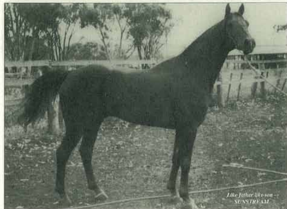
Like father like son - SUNSTREAM