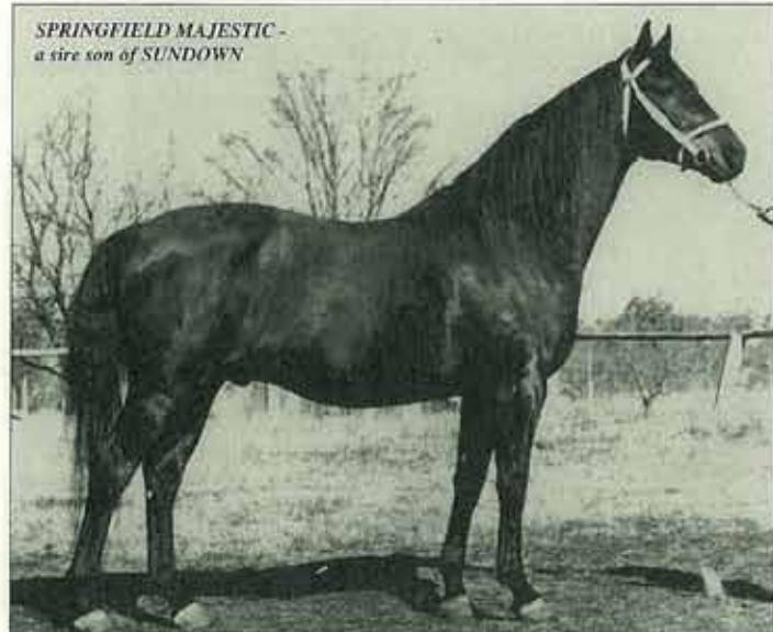
SPRINGFIELD MAJESTIC - a sire son of SUNDOWN

Champion Polo Pony Canberra 1968 and 1972, The Mitchell Trophy 1968 and 1971, The Hector King Trophy 1970 and the winning team of polo ponies, Adelaide 1968 and Tamworth 1970; Mr Jinx winner of many polo pony prizes including Champion at Sydney in 1971; Euchre, Champion Polo Pony, Dudley Cup 1973 and Musician, Champion District Hack, Goulburn Show.