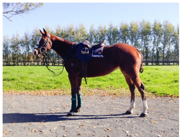
Haydon Can Can's full-sister Cha Cha Jewel