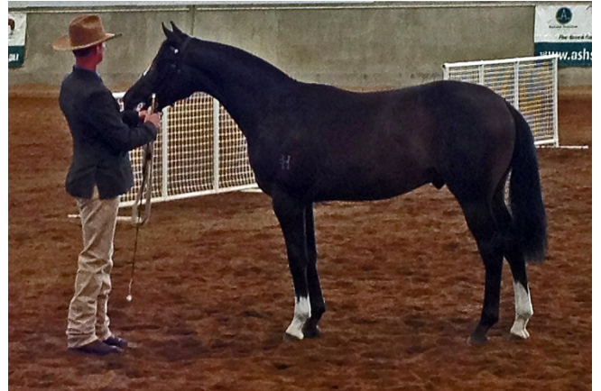
Haydon Zorba winner Yearling Colt, Nationals 2012 going on to win Champion Stallion at Brisbane Royal in 2014