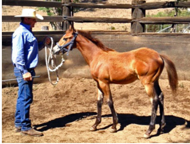
Haydon Can Can as a foal

Her full sister Haydon Cha Cha Jewel wins a BPP at Scone 2016