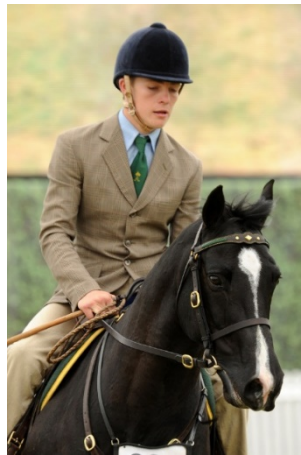
Can Can's half-brother Midland Pedro winning at 2014 Sydney RAS