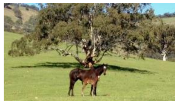
Haydon Maylight's first foal Haydon Quaver at one day old.