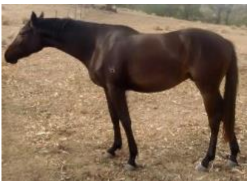
Haydon Maylight in the paddock as a two year old.