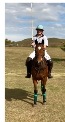
Haydon Can Can, Scone 2017