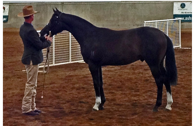
Haydon Zorba winner Yearling Colt, Nationals 2012 going on to win Champion Stallion at Brisbane Royal in 2014