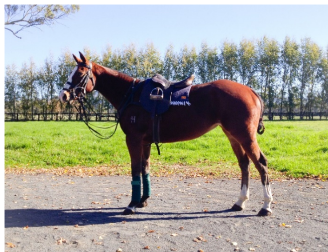
Half-sister Cha Cha Jewel