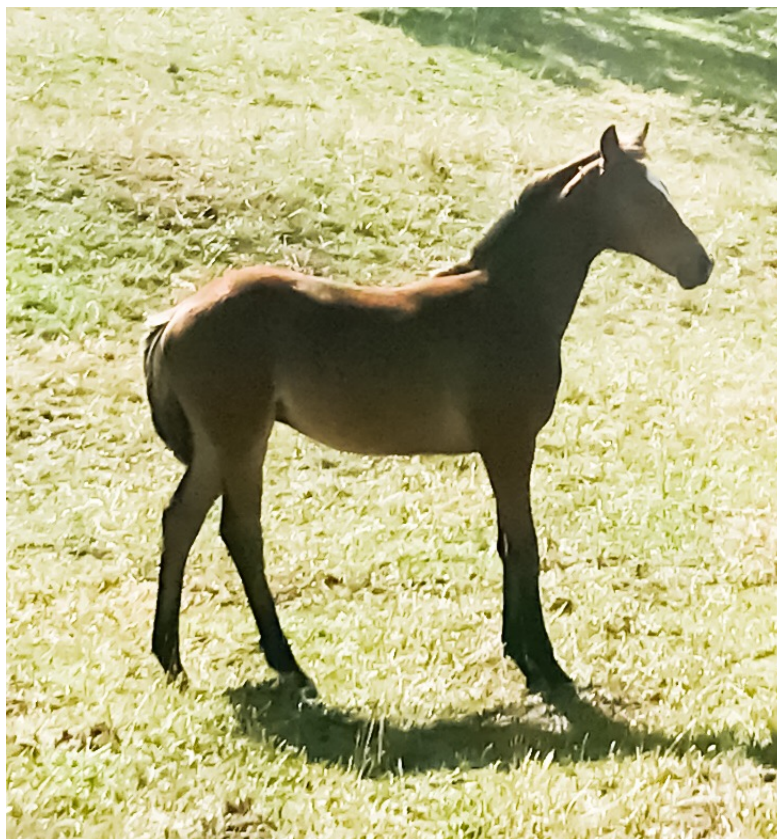
Haydon Kara at 4 months old

Haydon Kara is an attractive 2018 colt by Ellerston Churchill out of the half-sister to Hall of Fame mare Haydon Angel Jewel. His dam Haydon Dancing Jewel has been a top broodmare, producing the likes of special mare Haydon Cha Cha Jewel who won a BPP at Scone in 2016 and her full-sister's Haydon Can Can and Haydon Salsa and the Royal Show winner Midland Pedro.