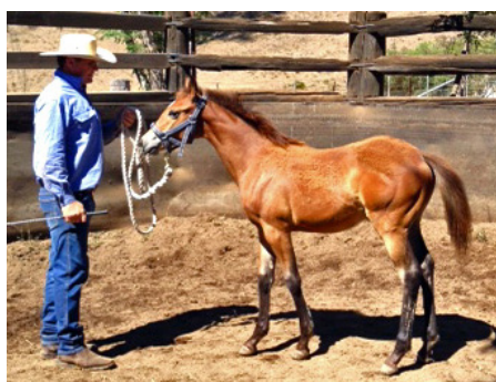
Haydon Can Can as a foal