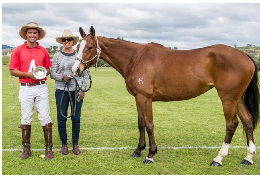
Haydon Cha Cha Jewel wins a BPP at Scone 2016