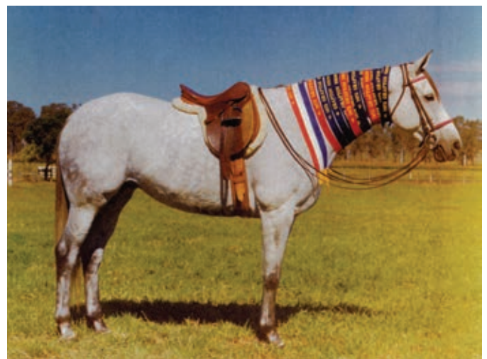
TARA - FM after the 1975 Grafton Show, which was her last show