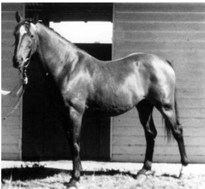
Sensation, sire of TARA - FM

With the return of STAR BLACK MINSTRIL - FS from Stuart's property at Miriam Vale, TARA's - FM 1981, 1982 and 1984