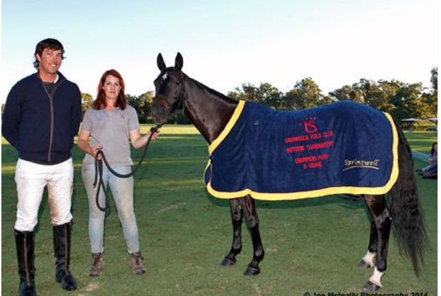
Jamaica won numerous BPP including at Garangula in 2014