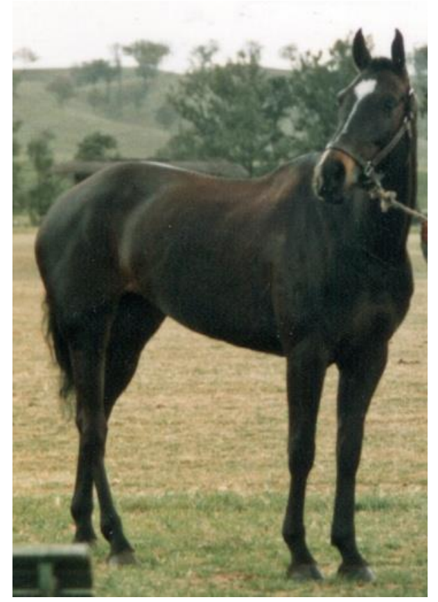
Haydon Star Night winning the Sledmere Cup