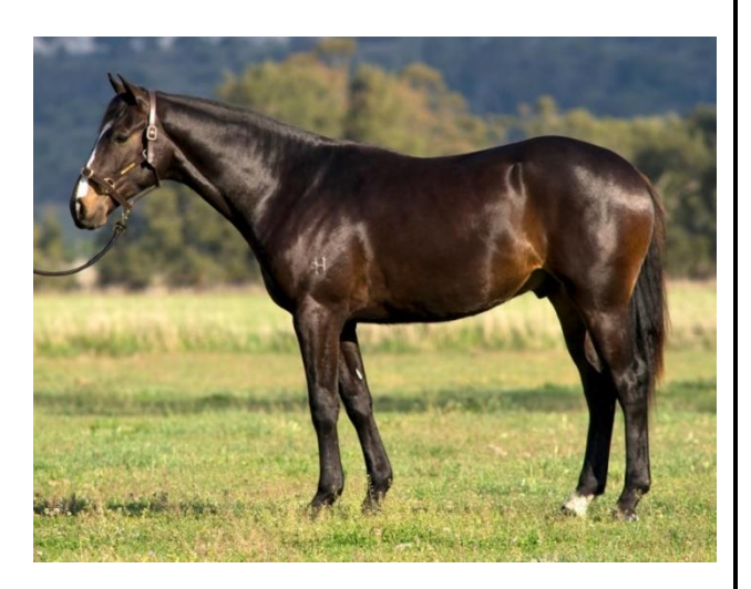
Haydon Zane by Techrico one of the top lots at the 2011 Colt Sale and now a successful sire.