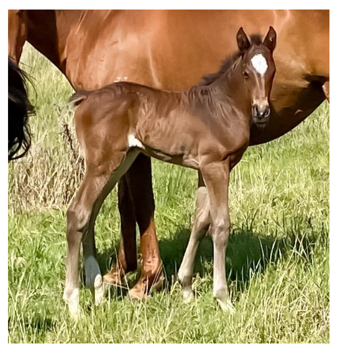
Haydon Luminance 1 day old

Haydon Luminance is a sister to Lunita and Malbec. She is by Ellerston Ruski from BPP award winner Haydon Paloma by Ellerston Solar. Ellerston Ruski's pedigree contains the internationally renowned mares Cruiser, Dinghy, Pinky, La Luna and Sheltie. Luminance has the bonus of a double across of Solar and La Luna combined with Drawn and the old Bloomfield Thora Family.