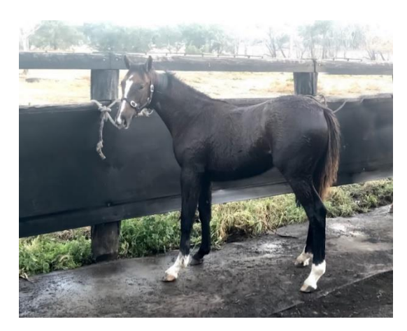
Lunita as a weanling 2019