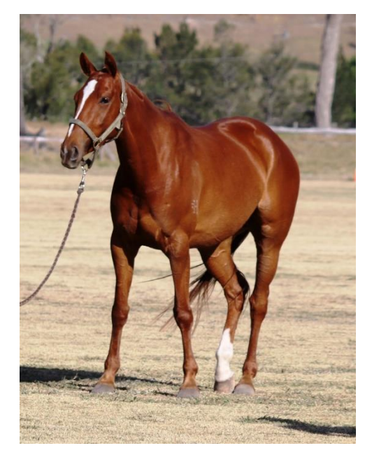
Haydon Paloma BPP winner, playing up to 22 goal polo

Haydon Paloma is bred on the Solar/Drawn cross and showed a lot of ability, playing up to 22 goal and being a BPP winner.