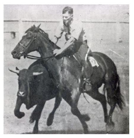
Haydon Twilight rated by FB Haydon as one of the best he rode