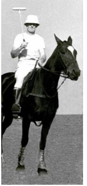
Champion polo mare Haydon Eulalie