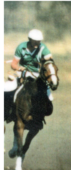
Champion mare Haydon Quartz