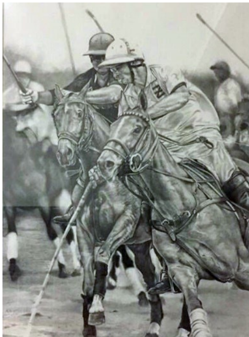
Cruiser and Mat Grimes, Ellerstou