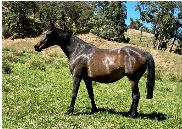
Haydon No Doubt