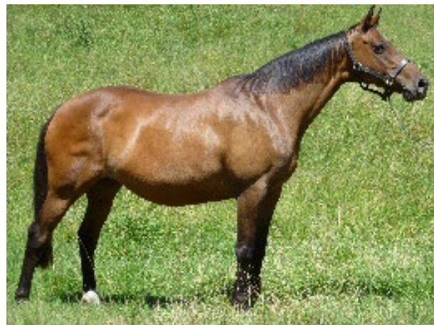
Haydon Lavender Jewel