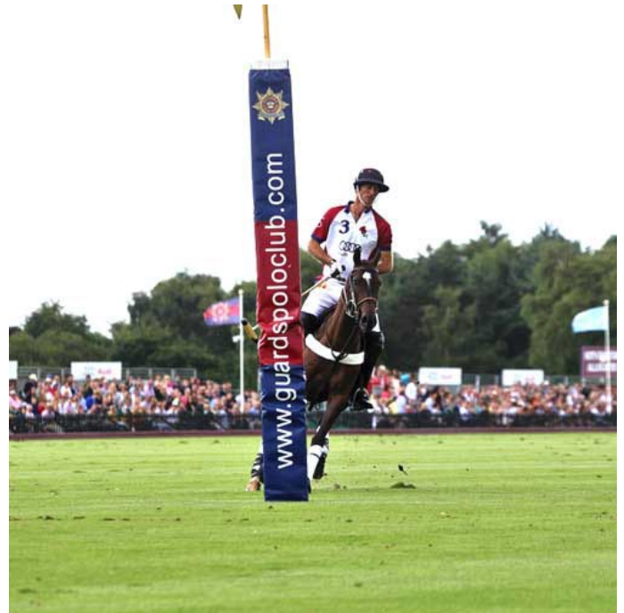
Haydon Spanish Jet winning the Westchester Cup 26 Goal Test Match