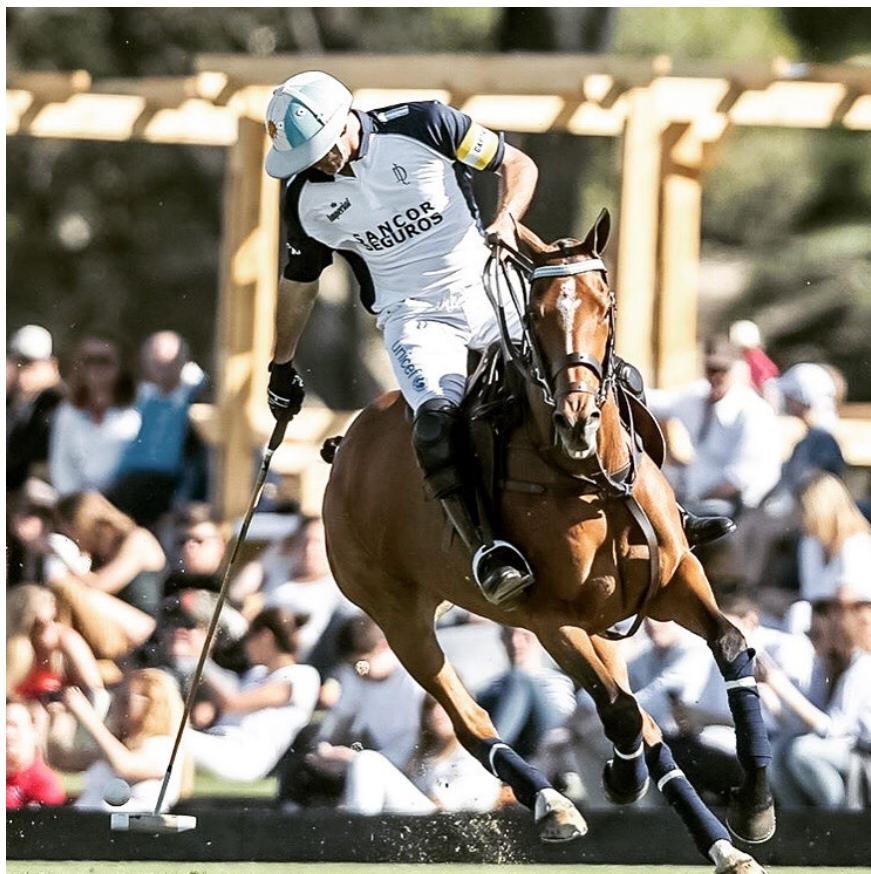
Cruiser playing the Argentine Open at Palermo with the world's best player 10 goaler Adolfo Cambiaso