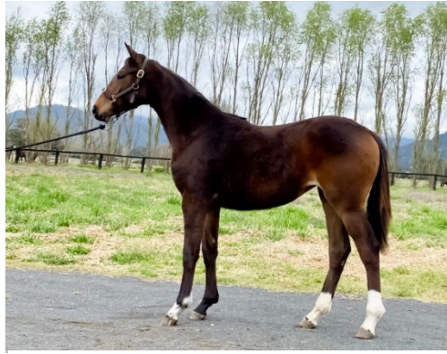
Full sister Haydon Faberge 2020