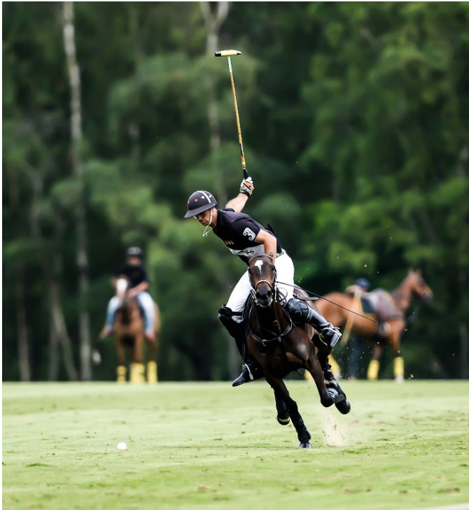
Haydon Spanish Jet in the Queens Cup, England