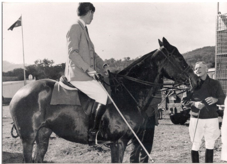
Haydon Gem with HRH The Prince of Wales, she won Champion Polo Horse at the 1967 Sydney RAS