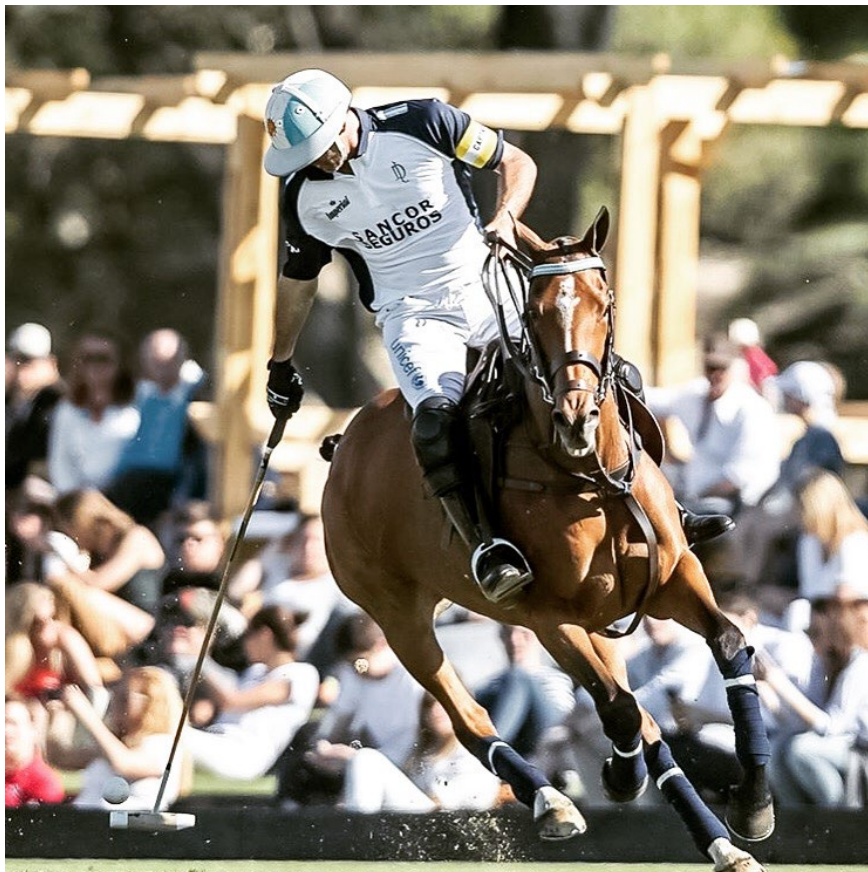
Cruiser playing the Argentine Open at Palermo with the world's best player 10 goaler Adolfo Cambiasso