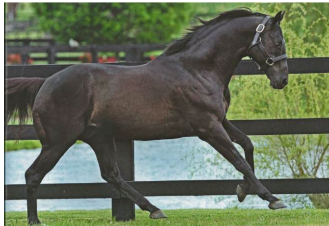
More Than Ready number one sire of winners in the world of all time