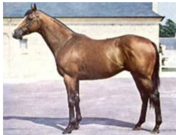
Champion sire Lyphard by Northern Dancer

Ready for Life produced; the Champion polo mares by Murrabong Victory Haydon Vital and Haydon Esprit both BBP winners, their full sister Haydon Joy de Vivre retained as a broodmare; their full brother the stallion Haydon Vintage ; Haydon Clementine an outstanding filly by Ellerston Churchill who died as a two year old and Haydon Zest by Patton also retained as a broodmare.