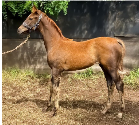
Full brother Haydon Magnum retained as a colt

Ready For Life was a neat type of TB mare only 15.1 HH with such correct conformation, true action and with a lovely head. She had a beautiful temperament mare and was always first to come up in the paddock. She was acquired to obtain the renowned More Than Ready bloodline and played polo until she had to retired from a long term knee injury sustained while racing.