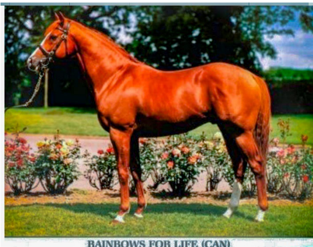
RAINBOWS FOR LIFE (CAN)

Ready for Life's dam Life's A Rainbow is by Rainbows For Life winner of 15 races and Champion Canadian Two Year Old , a shuttle stallion by Champion sire Lyphard. He was a neat TB type only 15.2 HH and in Europe his stock were renowned for their success off the track.