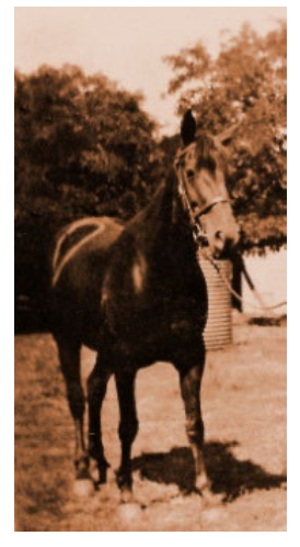
Haydon Dark Night campdrafted at the RAS in 1947

This is a proven old Bloomfield family tracing back to Flirt by Eclipse in the 1880's. Her daughter Haydon Thora won many of the original campdrafts in the 1920's. Her daughters by Haydon Starlight , Haydon Dark Night and Haydon Twilight were exceptional mares. Haydon Eulalie was a Champion polo mare who played in the finals of R.A.S Polo and the Gold Cup in 1954.