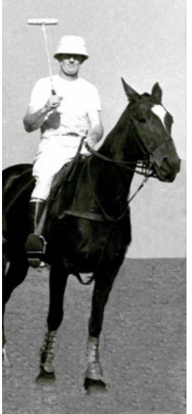
Champion polo mare Haydon Eulalie