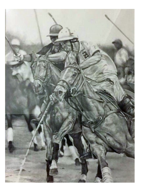
Cruiser and Mat Grimes, Ellerston