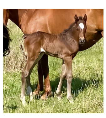
Haydon Luminance 1 day old