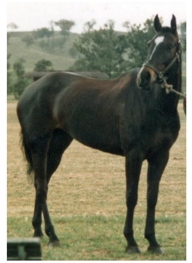
Haydon Star Night winning the Sledmere Cup