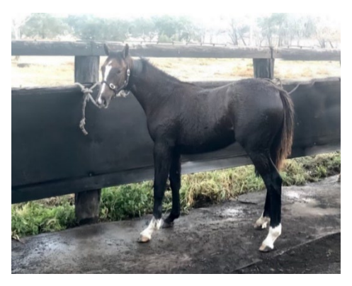
Lunita as a weanling 2019