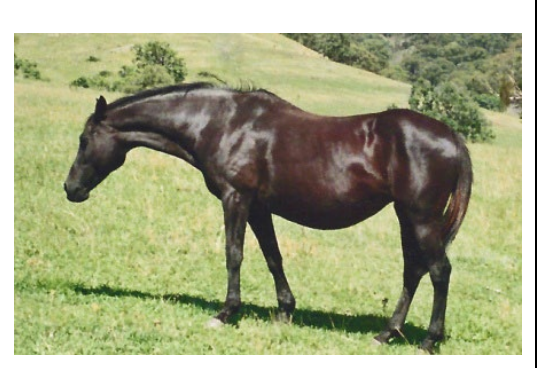
Haydon Ballerina as 24 year old broodmare

Haydon Ballerina produced many horses including Nat good Buchanan Trophy winner and sire Haydon Dancer; polo gelding Havdon Barrabucci : Havdon Nightlight dam of successful sire Haydon Nightwatch, Haydon Moonlight & Dawnlight; Haydon Ballerette's dam of Haydon Night Diva another Nat Buchanan winner.