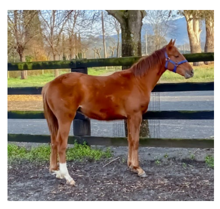
Malbec as a weanling 2020

Haydon Paloma is bred on the Solar/Drawn cross and showed a lot of ability, playing up to 22 goal and being a BPP winner.