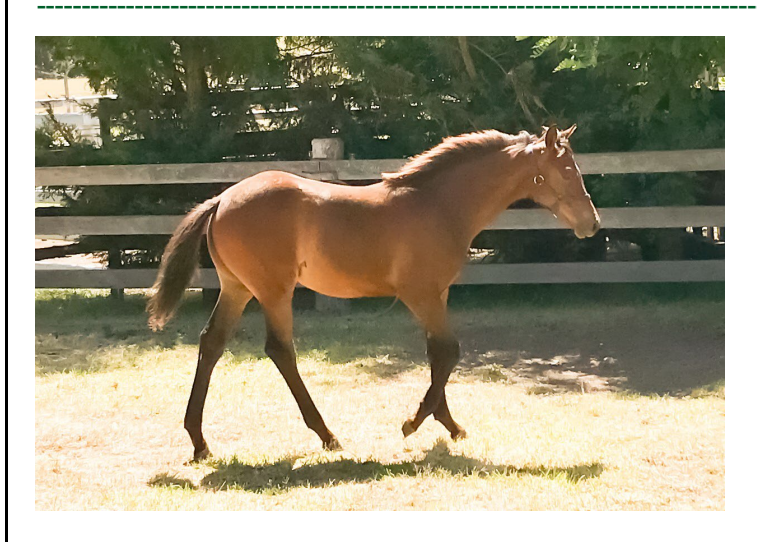
Haydon Lunette as a foal