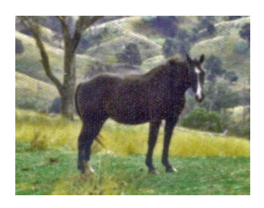
Haydon Pirouette officially now a ASHS Foundation Mare