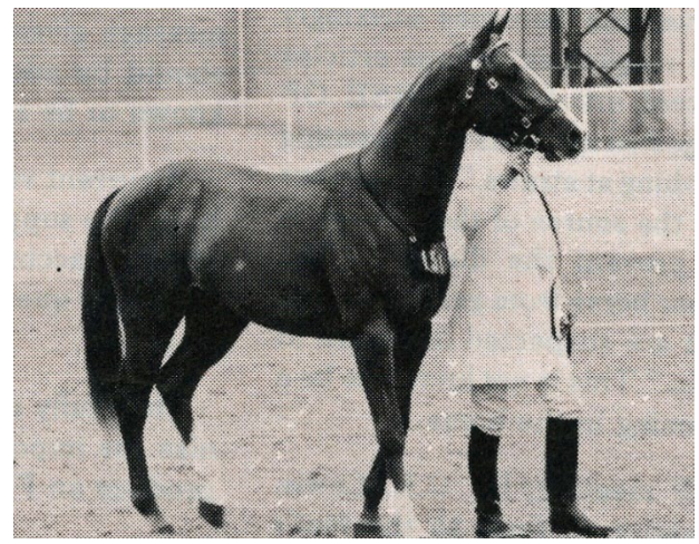
Haydon Blu Night's full brother Haydon Bright Night was very successful in the showring and as a sire