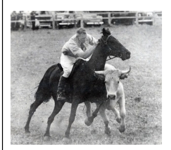
Haydon Dark Night campdrafted at the RAS in 1947