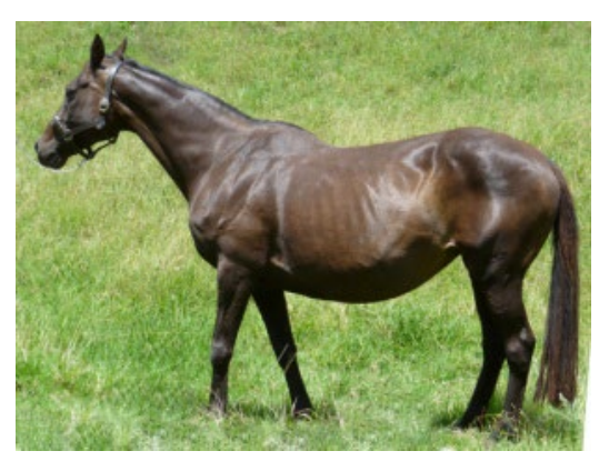
Broodmare Night Lady by Haydon Never

Haydon Night Time (left) with such good conformation was selected to replace to her mother as broodmare and has produced well. Havdon Night Gift is playing another polocrosse and full-sister Haydon Night Nightshade is breeding well.