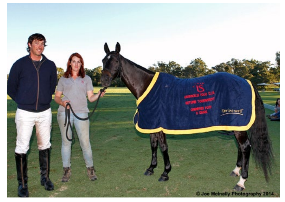
Champion mare Jamaica